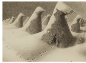
Grant Wood, January , lithograph on paper, 1937. Museum Purchase Funded in Part by the Yonkers Foundation Inc. [1992.3]

This exhibition answers the question often asked by Museum visitors, What's A Lithograph? It highlights thirty-five lithographs from the Museum's Permanent Collection and features informational text panels explaining what a