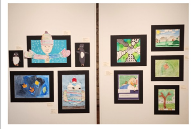
Display Image from the last Elementary School focused School Art Show in 2023

Center Space Gallery • February 20 – April 18, 2026