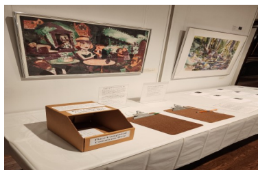
Gallery Image from Everyone is a Critic:4