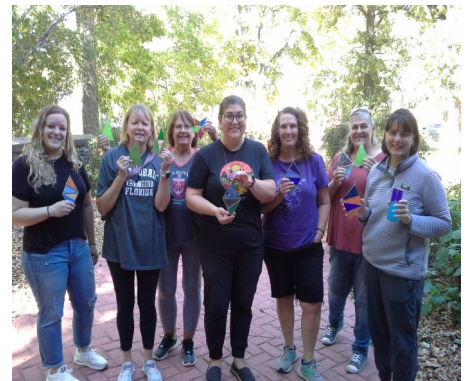
Stained Glass Copper Foil Ornament class, September 2024