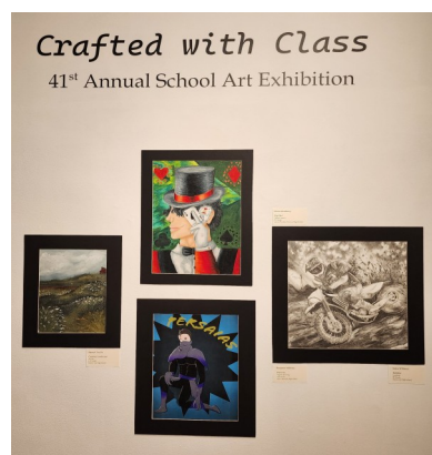
Gallery Image from School Art Exhibition- Crafted with Class

Reception refreshments provided by Alpha Delta Kappa, an honorary sorority for women in education