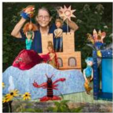
Everyone enjoyed the "Magical Fish & Mermaids" puppet show on April 13.

Thanks to the Bertha Stebens Charitable Foundation, visitors of all ages were able to enjoy these puppet shows. Bus subsidies were provided by 3M.