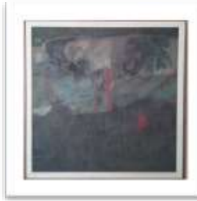
2022.001 – Byron Burford, Figure with Tanks , oil on canvas, 1963. Gift from Richard and Kay Leet.