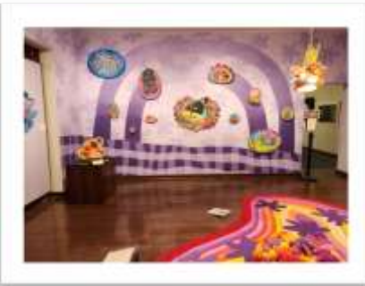
Gallery Image from Within The Butterfly Cave