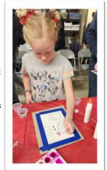
Holiday Open House attendee decorating tree craft.

In attendance were: 192 adults and 199 children.