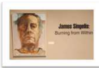
Singelis – Title Wall

Rural to Urban: Landscapes in the Permanent Collection