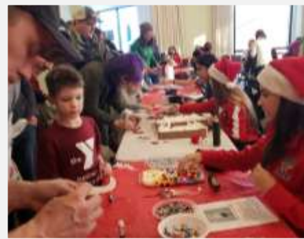
Families and friends enjoying the free crafts at Holiday Open House.

In attendance were: 252 adults and 306 children.