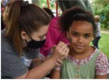
Face painting at MacNider Arts Festival

Rain or shine—we had both during the 2022 MacNider Art Festival! On June 11 around 300 area children enjoyed nine free “Create Waves” under-the-sea themed crafts as well as stepping stones and face