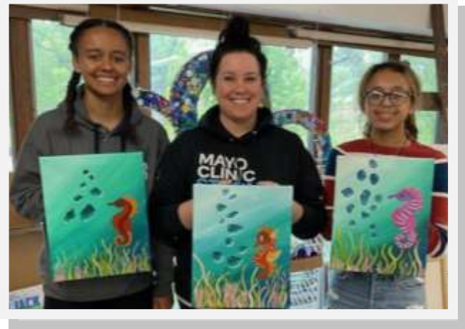
A group of seahorse paintings from Paint With Me, a family class, held Spring 2022.