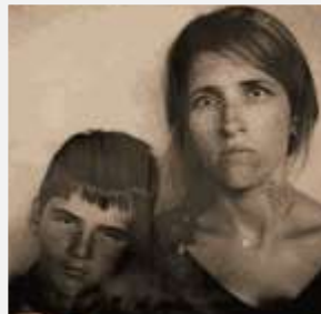
London Amara, Mother and Son , Ambrotype original, archival pigment print, 2019.