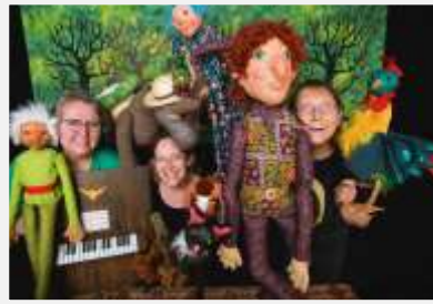
The Fall Puppet Show was “The Bremen Town Musicians” presented by Eulenspiegel Puppet Theatre.

Puppet Theatre. In attendance were 61 adults and 122 children.