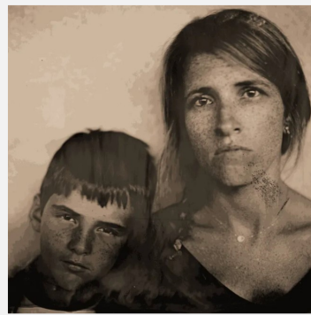
London Amara, Mother and Son , Ambrotype original, archival pigment print, 2019.

May 6 – July 6, 2022 • Kinney-Lindstrom Gallery