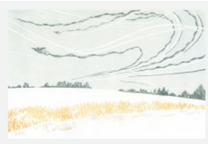
2021 Best in Show Award Winner – Lori Biwer-Stewart, of Osage, IA, January Flight Pattern , linocut on paper

Area Show: 48 is an all media juried exhibition open to anyone above high school age living within 100 miles of Mason City.