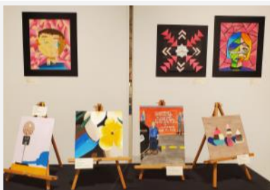
School Art Image – 2021

February 18– April 9, 2022 Center Space Gallery